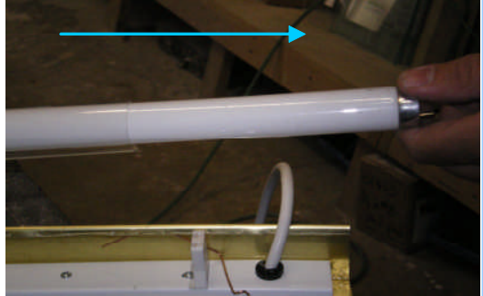
6) Slide light out of protective acrylic tube.

3) Gently turn screw driver to pry directly off socket